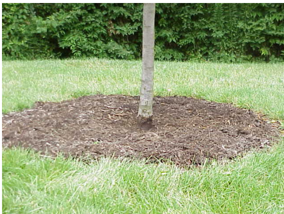
Correct Mulching Technique

Thoroughly cover the area to a uniform depth to be most effective. Low or bare spots are prone to weed problems and uneven mulch does not properly insulate the soil.