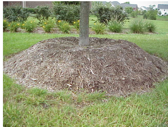
Poor Mulching Technique